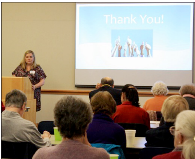
Volunteer Day, March 2015.