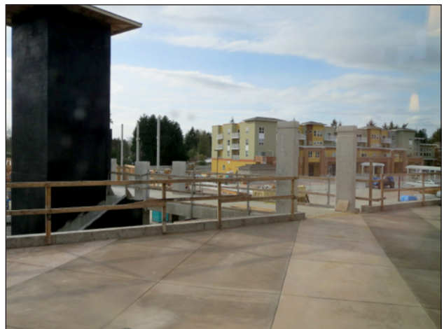
Norma Eades, Operations Supervisor at Lake Hills and Crossroads, sent us this picture of construction at Lake Hills Village as seen from the Library. The big tower to the left is the new elevator shaft, which will link to the veranda in front of the library. Once the new access is functional, the old elevator and stairs will be removed and the parking lot below the building closed.